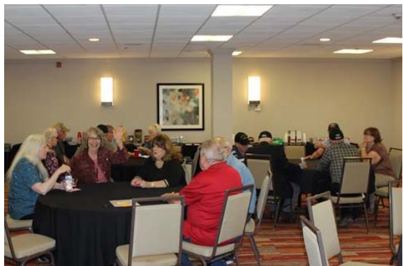
Hospitality at the Hotel