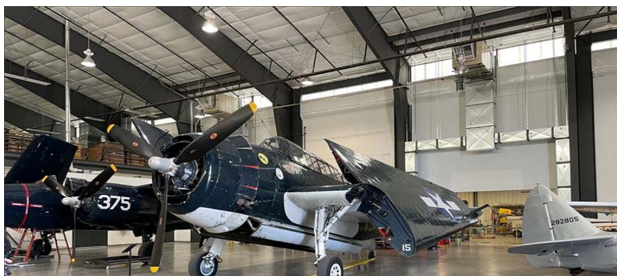
World War II Aviation Museum