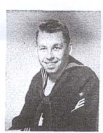
D. Pletz, ETRSN